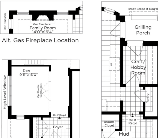
Opt. First Floor Plan Craft/Hobby Room